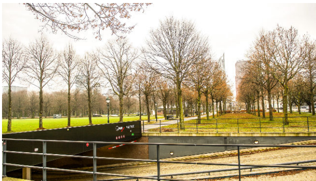
Figure 5: Malieveld

Although this underground car park is in the city centre, it is easy to reach from the motorway. The car park offers 600 parking spaces as well as bicycle parking. Like many other of Q-Park's city centre car parks, this is an ideal location to park and switch transport mode to reach a destination in The Hague.