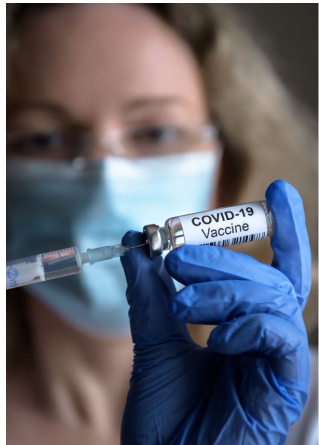
Figure 10: Vaccine appointment? Discounted parking!

Throughout the pandemic, Q-Park has been determined to be part of the solution and this partnership is a great example. Q-Park's other contributions included more flexible parking products for healthcare workers and opening up our assets to a variety of healthcare needs.