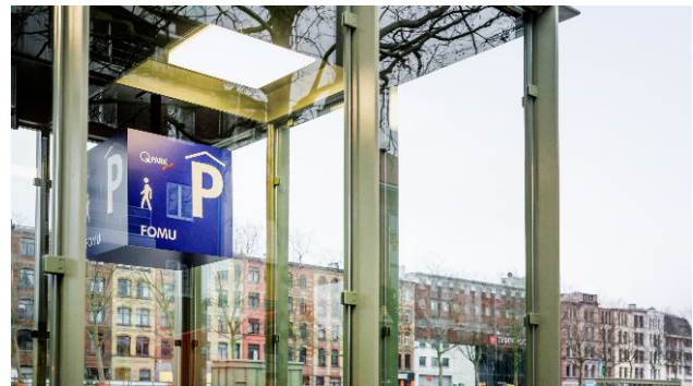
Figure 12: Glass features

This helps customers plan their journey in advance. When people know where they will park, they programme their in-car navigation accordingly. This enhances road safety as motorists are not distracted while searching for a place to park in an unfamiliar city.