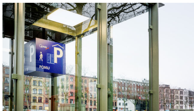
Figure 12: Glass features

This helps customers plan their journey in advance. When people know where they will park, they programme their in-car navigation accordingly. This enhances road safety as motorists are not distracted while searching for a place to park in an unfamiliar city.